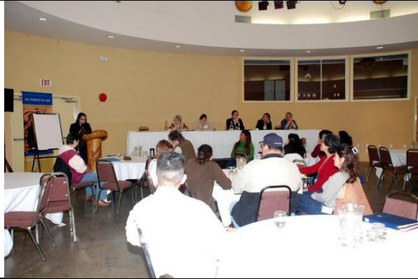
UBC Law – Aboriginal Justice Conference at the Quaaout Lodge. Little Shuswap, BC, Canada